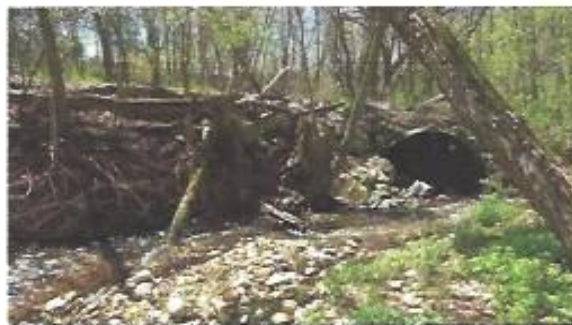
This culvert Maug Road, along with a second culvert at Skunk Hollow Road, will be replaced in early 2020 as part of a larger stream restoration project.

deep scour hole. Brook trout need to swim upstream to spawn, but they cannot make the 6-inch jump at Skunk Hollow Road.